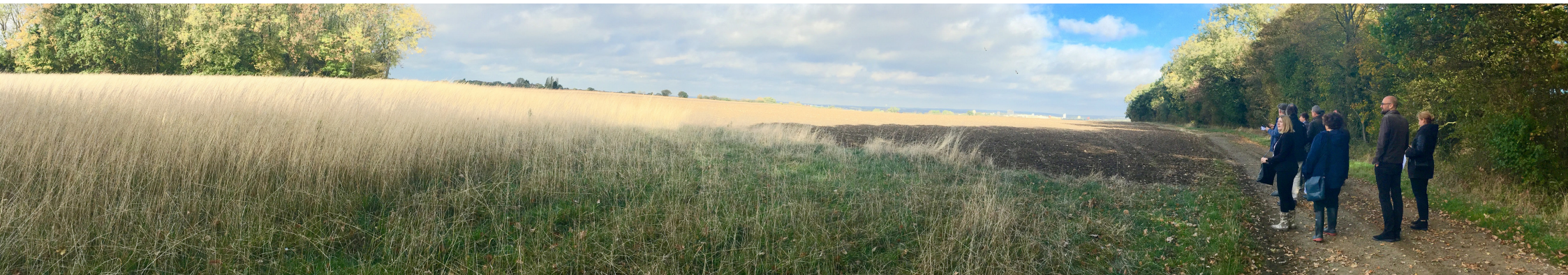
Panel site visit

Design Review: Principles and Practice Design Council CABE / Landscape Institute / RTPi / RIBA (2013)