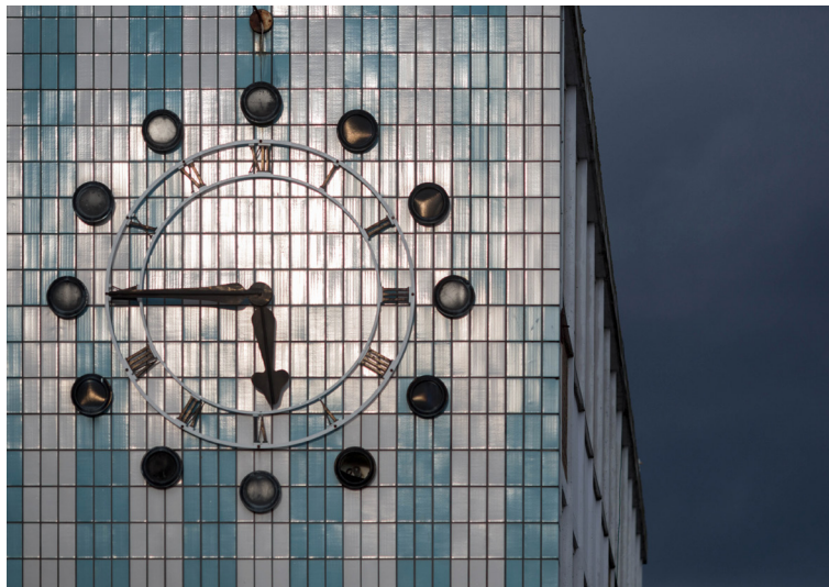
The Clock House

Because of the strategic design work required to bring forward the garden town, the Quality Review Panel's remit extends to advising the planning authorities on policy and design guidance documents, such as Supplementary Planning Documents (SPDs), and design codes. Panel members may also be called on to help facilitate community engagement on design of the garden town.