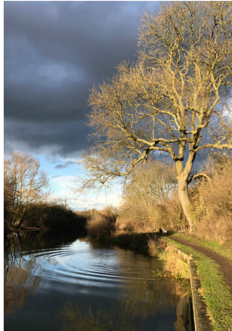
River Stort